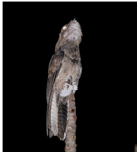
Grey Potoo calling to the moon, Argentina.

When comparing our tours with those of our competitors, it is worth checking the credits on photographs. On other websites many are simply bought from agencies. The beauty of our website is that the pictures are taken by customers or leaders, on the tour itself or during a recce.