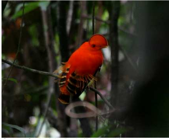
Guyana Cock-of-the-Rock.