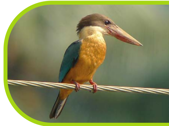
Stork-billed Kingfisher, India