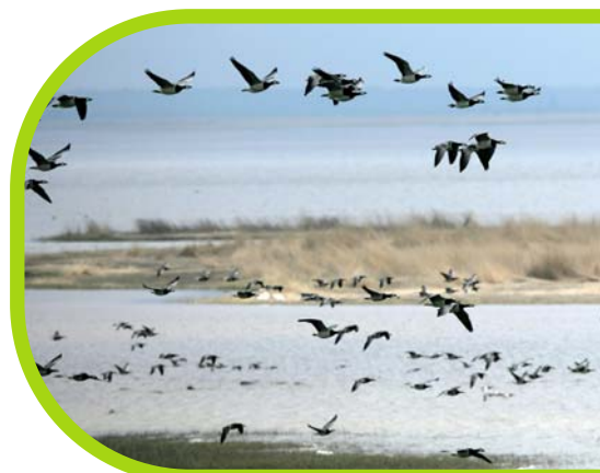
Barnacle Geese at Matsalu Bay, Estonia