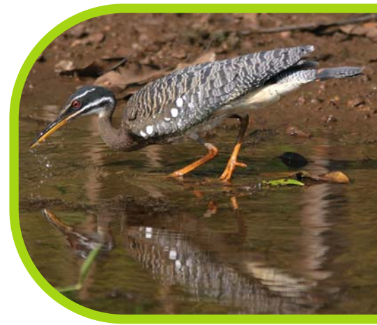
Sunbittern, Pantanal, Brazil

I am running out of space to write about the Czech Republic (which is another favourite that we will be returning to in 2013), Extremadura and the Gredos (which gave amazing views of Bluethroats), Trinidad and Tobago (always tremendous boat trips and particularly good for lekking manakins in 2011) and Malawi and South Luangwa (three Leopards on top of an amazing bird list!)."