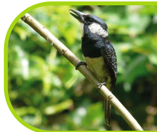
Black-breasted Puffbird, Pipeline Road, Panama