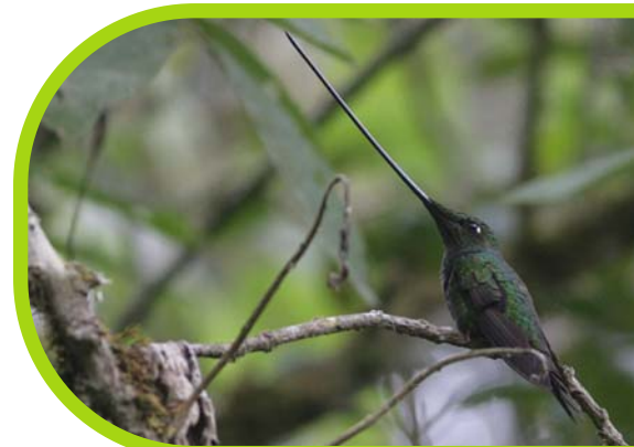
Sword-billed Hummingbird, Ecuador (Phil Palmer)