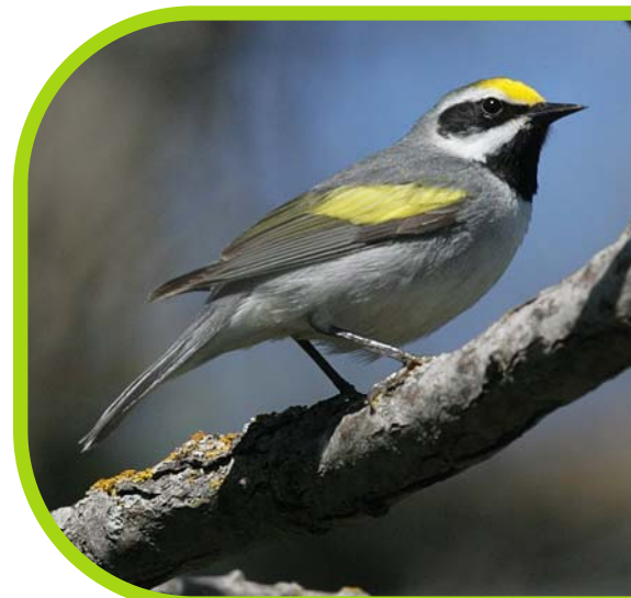
Golden-winged Warbler, Manitoba Canada (Phil Palmer)