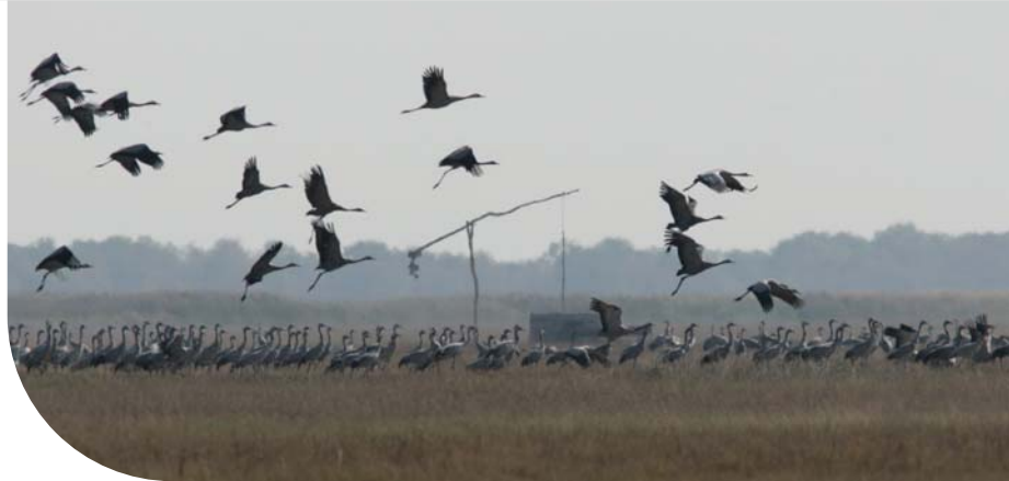
Common Cranes in the Hortobagy

Due to a new route offered by airline Jet2, our ever popular Hungary trip can now be joined from Leeds/Bradford Airport. This is in addition to both Manchester and Heathrow departures. See page 48 of our brochure, or contact us for details.