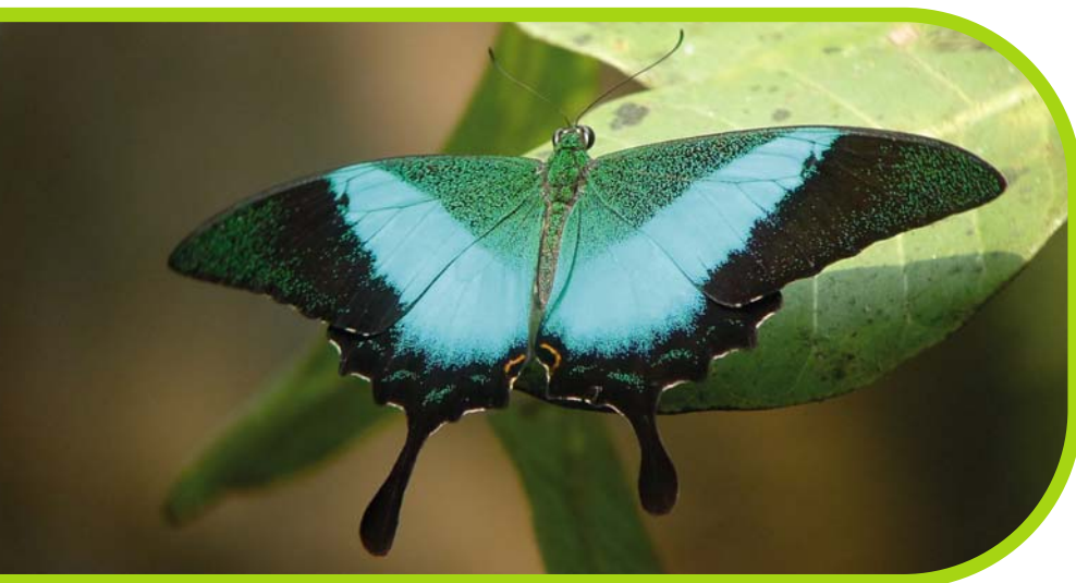
Malabar Banded Peacock, Maem Lake, Goa

Butterflies too, were very spectacular. A new field guide enabled us to identify almost 40 species, including the spectacular Southern Birdwing, Malabar Tree Nymph and Malabar Banded Peacock.