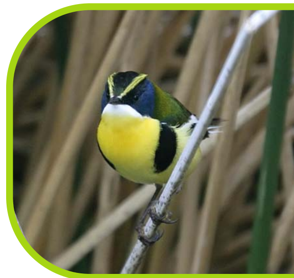
Many-coloured Rush-tyrant, Argentina

In a whole year of bird tour leading there are many highlights, but here is an extract from Roger's personal diary of one day in the Pantanal on the 2011 tour. The only censoring was to change a word to 'blooming'.